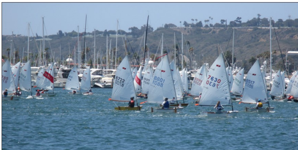
Dutch Shoe Marathon