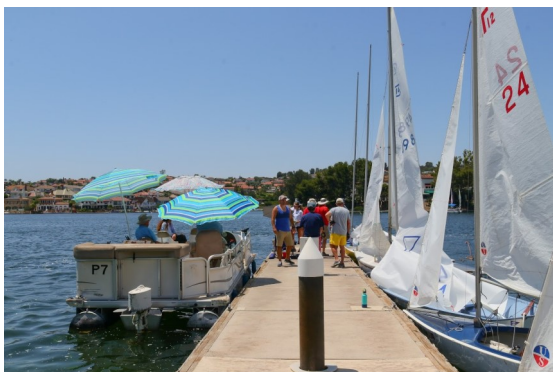
Cheering and jeering from the dock

Race Day came and all were ready. We started the day with a Pancake Breakfast. It's a lot of fun. After breakfast, boats were fitted and teams turned out in their team colors, Red, White, Blue and Gray. Team colors are necessary so the three team members standing on the dock can cheer on their teammate and it also makes it easier to hurl insults at them when they are not doing well.