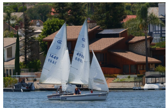
Blue leading Gray to the leeward mark

Race 1. After an excellent start, two time defending champion White team finished in first. It was a hard fought battle for the rest with Blue in 2, Gray in 3 and Red in 4. The second race was led by the Expo's with Blue finishing 2, White finishing 1, Gray 3 and Red 4.