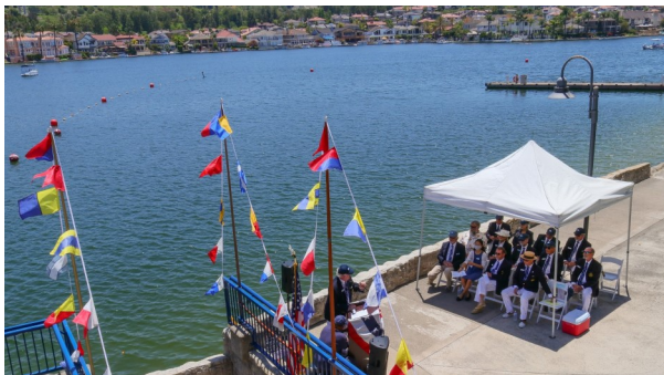
Current Flag Officers and Staff Commodores were dressed in their summer formal wear.