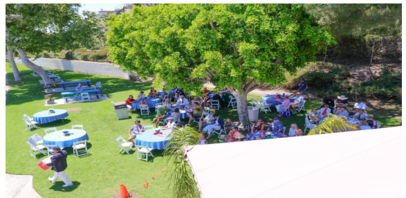
Overhead view of the audience