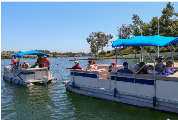
The parade begins

A boat parade around the lake finished this grand day. As our time wound down, a few of us sailed or continued to socialize. Port Captain Graham Newman and I took a casual spin in Graham's boat – and were dismasted mid lake!