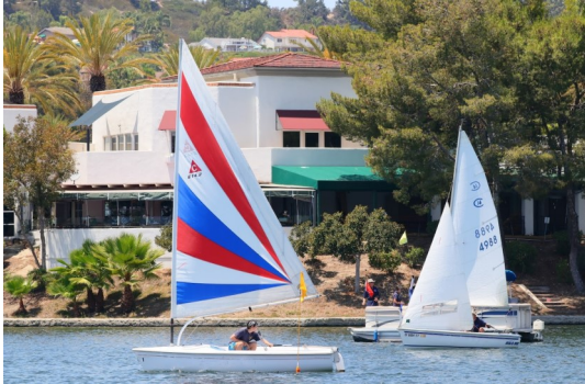
Blue "passing the baton"

Now the day got interesting. The winds blew nicely, dock mates were busy yelling encouragement or insults depending on the moment, race committee baked in the sun, Team Captains paced and our Race Chair adjusted the course for the new winds.