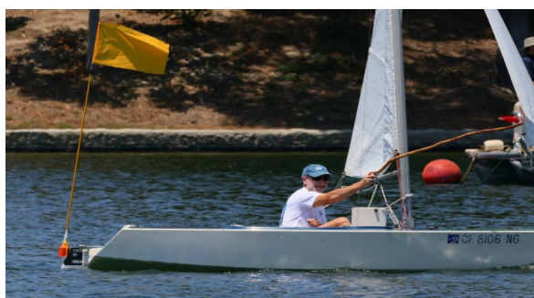
Arnold's Custom Pole