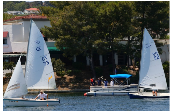
White Team "passing the baton"

Expos are rotated after each race, but each team can decide whether to rotate skippers or not.