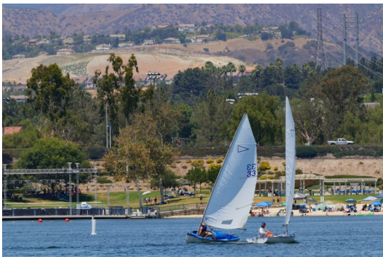
Blue and Gray at the leeward mark

Now the day got interesting. The winds blew nicely, dock mates were busy yelling encouragement or insults depending on the moment, race committee baked in the sun, Team Captains paced and our Race Chair adjusted the course for the new winds.