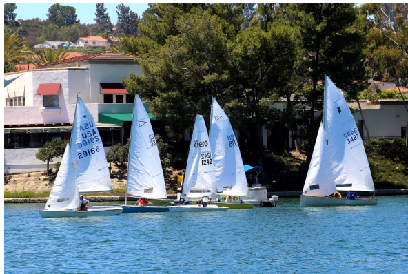
A Fleet start

After some relatively cool conditions through much of the Spring, summer hit with a bang for the Summer Regatta on June 26 th . With temperatures forecast in the mid 90s and not a great deal of wind, it promised to be an absolute scorcher out on the water and racers were advised to bring along plenty of fluids.