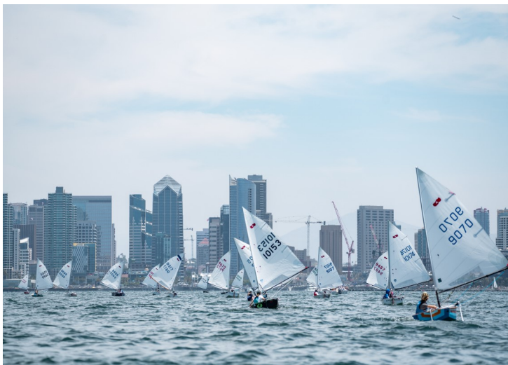
Fleet sailing past downtown San Diego