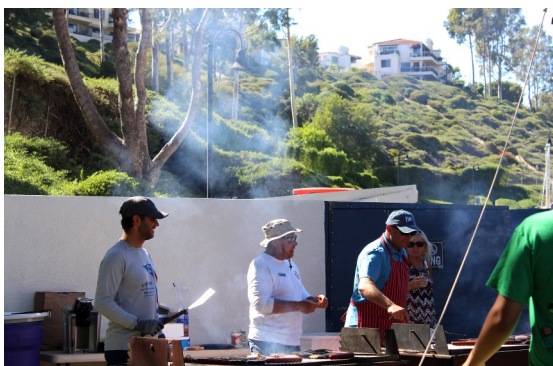
Cooks at work