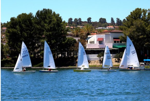
A Fleet in line

In C Fleet, it was a very close battle between Vivian Ikeda, Rod Simenz and Maverick Trudell. Maverick just did enough in Race 1 to earn victory by a slim margin over Vivian, with Rod some way behind. Vivian turned the tables in Race 2 and sailed away from everyone, with Rod just pipping Maverick on corrected time for second place. In the final race of the day, Rod led the way, overcoming both Vivian and Maverick, but it wasn't enough for the regatta win: final result was Vivian 1 st , Rod 2 nd , Maverick 3 rd .