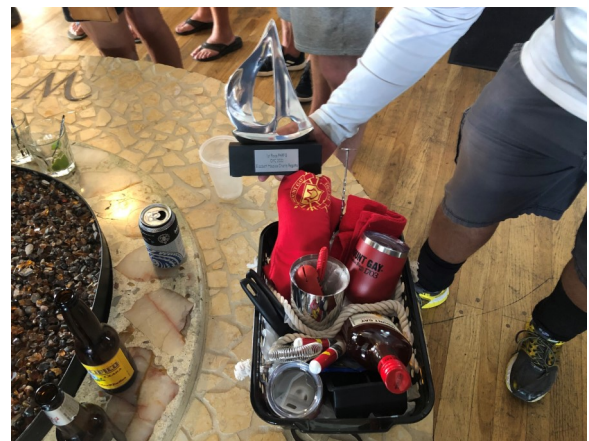
First place trophy and prizes