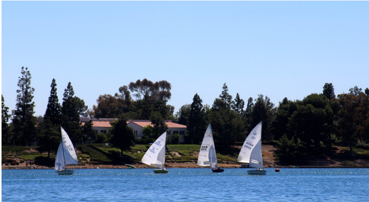
B fleet downwind