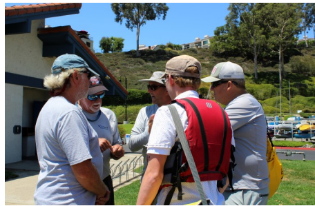
Grey Team strategizes