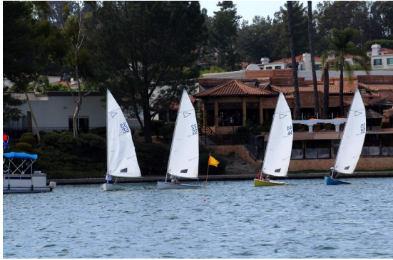
Balboas at the start