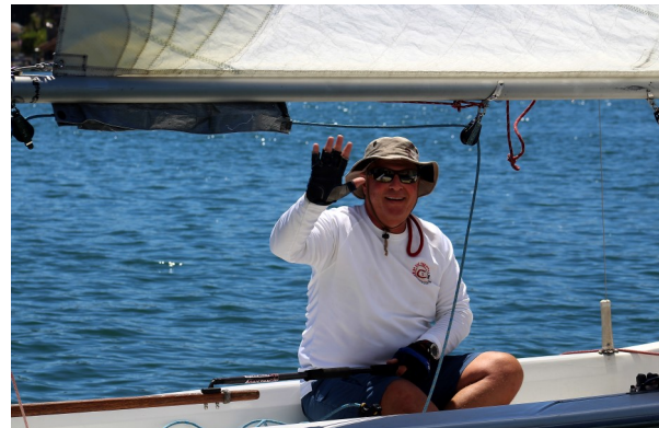
Spirit of the day

See you all out on the water and... starboard!!