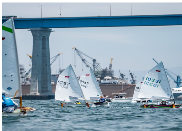
Tyler #9267 approaches Coronado Bridge

C2 and C3 fleet and 52 boats in Ted's Senior fleet. They had good wind's averaging 8.5 knots for their odyssey. It was a fast race with no encounters with war ships that would have required the Sabots to stop and hold their position until given an all clear (yes that actually happens). Ted's class started last and he finished ahead of 31 boats overall. Tyler's class