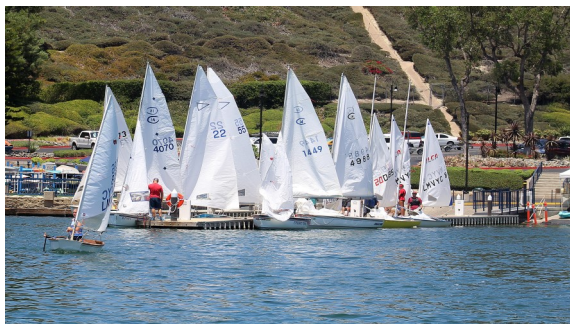
Fleet almost underway