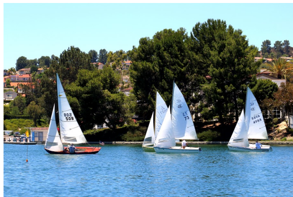
B Fleet start

In typical Lake Mission Viejo fashion, once sailors were briefed and headed up towards the start line, conditions actually improved and we had a nice 4-5 knots of breeze for much of the day. It was one of those days when the wind hole West of the start line played a big role,