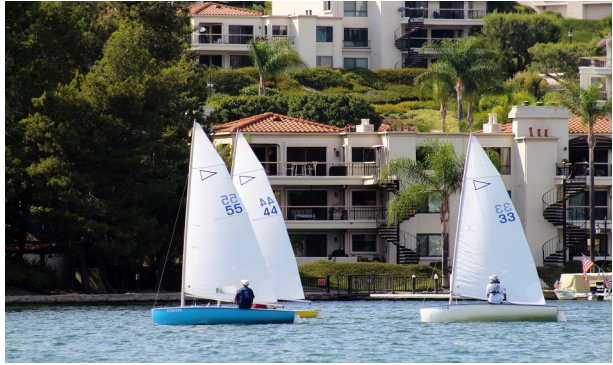
On their way