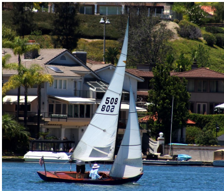
S/C & R/C Rixfords

In C Fleet, it was a very close battle between Vivian Ikeda, Rod Simenz and Maverick Trudell. Maverick just did enough in Race 1 to earn victory by a slim margin over Vivian, with Rod some way behind. Vivian turned the tables in Race 2 and sailed away from everyone, with Rod just pipping Maverick on corrected time for second place. In the final race of the day, Rod led the way, overcoming both Vivian and Maverick, but it wasn't enough for the regatta win: final result was Vivian 1 st , Rod 2 nd , Maverick 3 rd .