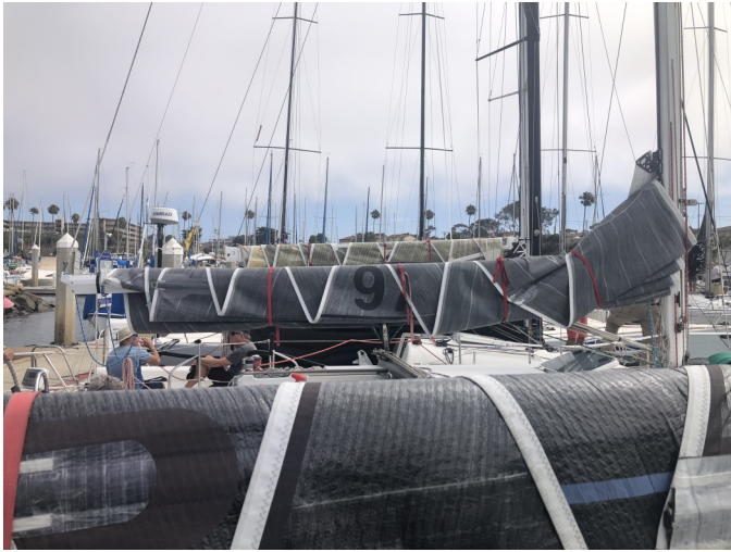
A portion of the fleet lined up

The start was great, we got clear air right away, and led the fleet to the windward mark, after about two tacks. At the mark I hoisted the chute and trimmed it to the next mark - we hit 10.4 knots! The 2nd race the Islander had a problem and dropped out, we were able to repeat the same on race 2. Which put us in 1 st place.