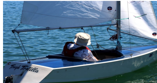
Rod showing his stern