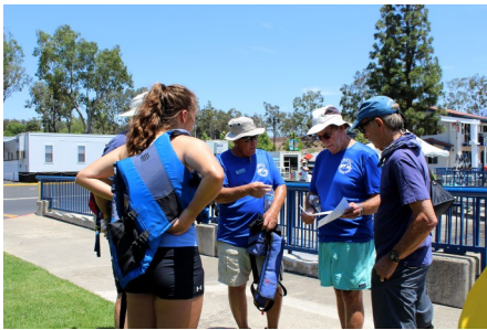
Blue Team huddle