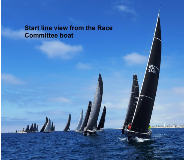
Start line view from the Race Committee boat

Several LMVYC sailors participated in this year's N2E race. The race start was on April 26, with two starting lines. This year, as in last year, the event made up three races: Newport to Ensenada, Newport to San Diego, and Newport to Dana Point.