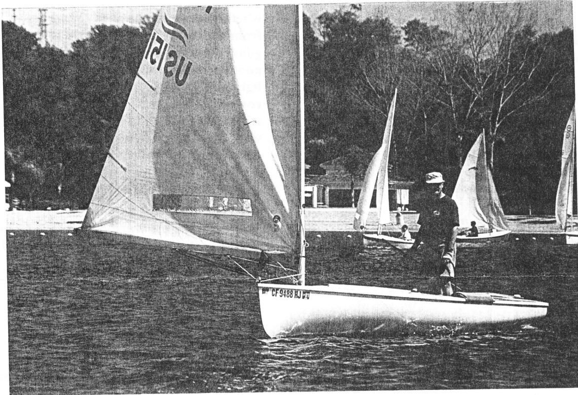
Seventh Inning Stretch ???